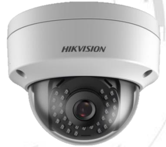
Non 2.8 mm Fixed Lens