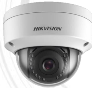
2.8 mm Fixed Lens